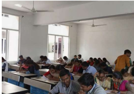
Click to View