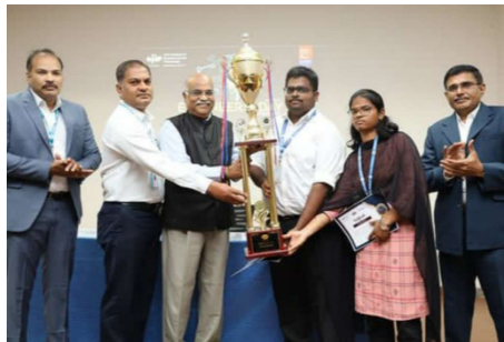
Click to View